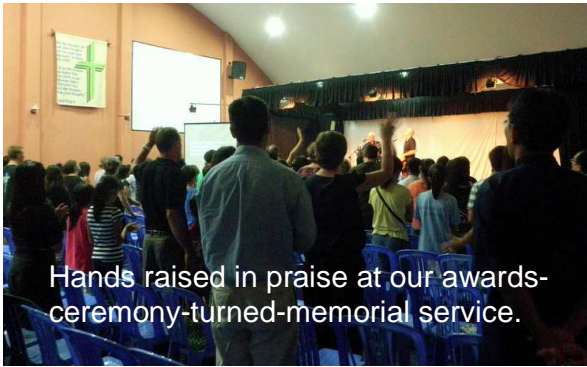
Hands raised in praise at our awards-ceremony-turned-memorial service.

celebration of his life, and the life that is ours in Christ. It was also a reminder of why I am in Cambodia – to point the way to life in Christ after death.